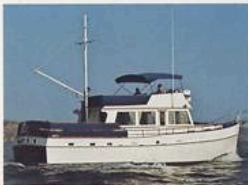
The Grand Banks 48 shown in this brochure is the IN PURSUIT owned by Jim Ferber of Los Angeles.

- Teak interior trim and paneling - Teak parquet on all cabin soles - 6" foam mattresses - 4" foam cushions - Teak furniture - All interior teak is Golden Burmese with satin finish varnish - 30" eight spoke steering wheel - Private enclosed toilet compartments with heads, basins, and showers - All windows three-ply safety glass - Sliding and opening windows and ports throughout - Cabin headliners of acoustical vinyl - Teak cabinets, drawers and hanging lockers throughout - Helmsman's seat - Helmsman's station equipped with full instrumentation, including water temperature and oil pressure gauges, engine hour meters, ammeters, and tachometers - Trash bin in galley opens on side deck for disposal - Teak "L" shaped settee - Galley range with oven - Teak dish locker and glass rack - Teak bar with bottle and glass rack - Stainless steel double galley sink - Teak valances in main cabin and owner's cabin - Teak grab rail in main cabin overhead - Teak "hi-lo" table - Center opening windshield - Chain locker - Insulated icebox under settee - Teak medicine cabinets - Full-length wall mirror in owner's stateroom - Mirrors in all heads - Bathtub/shower in owner's cabin -